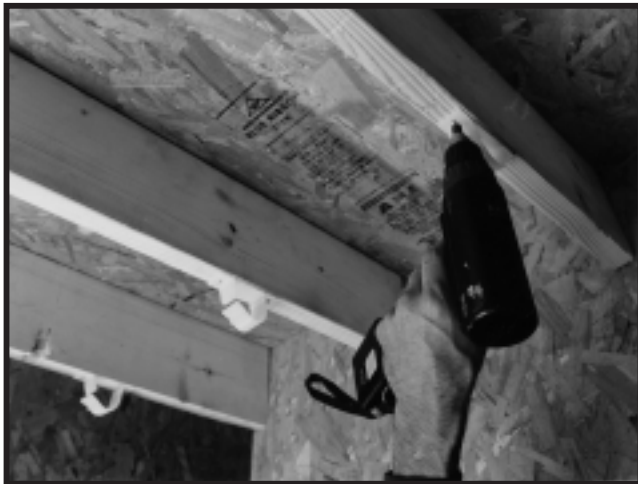
Low-cost clamps reduce mounting labor by half!

“Another great innovation from THERMOMFG® ”